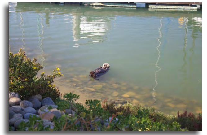
Buffet Table

The cover photo on this month's Point Lobos Magazine is by John Drum . Congratulations!