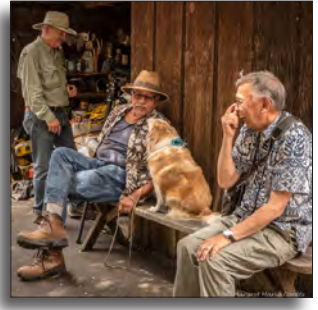
PTCC members enjoy the day

To follow our Group Shoot tradition, all who were there are asked to put together up to ten images that they're most happy with for a short program at a meeting in the near future. Please try to get them to Ken by Friday, August 4<sup>th</sup>.