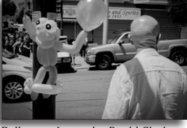
Balloons